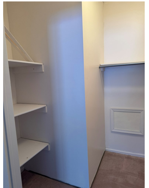
Second Bedroom Closet