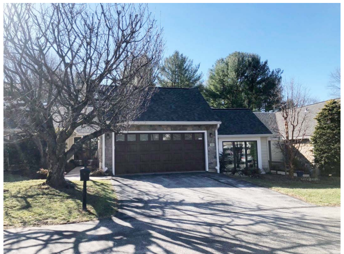
Front of house