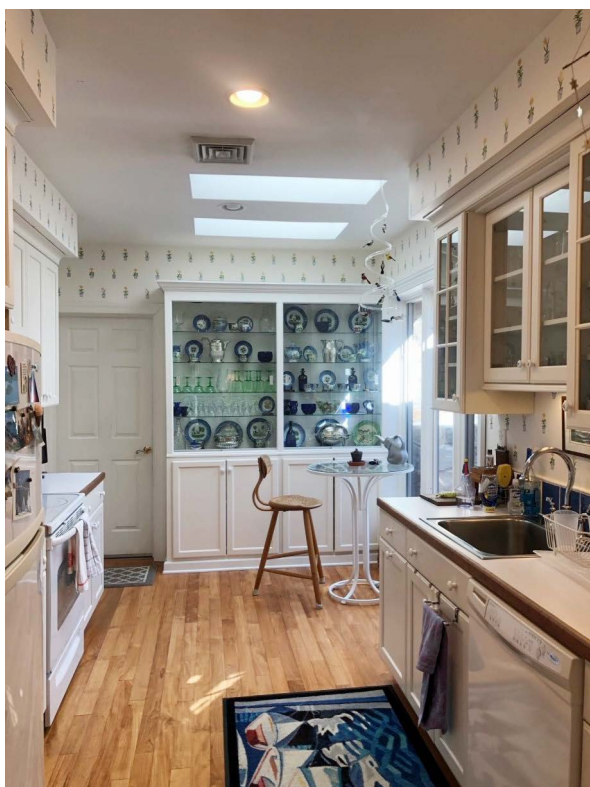
Kitchen with skylights and built-ins