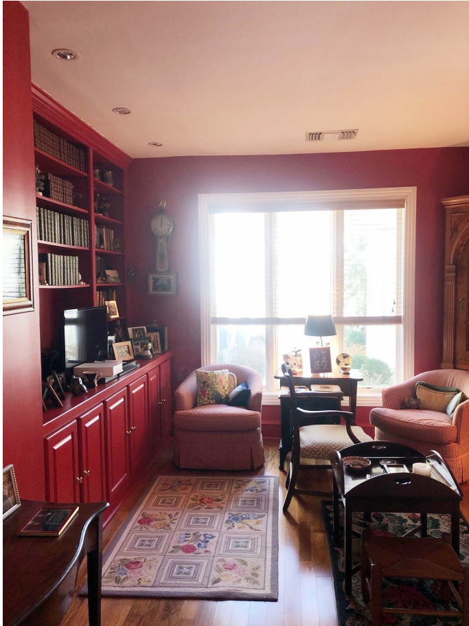
Den with built-ins