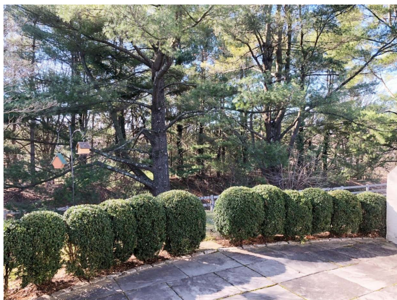
Patio and view from living room

$1,250,000.00 * TWO BEDROOM, TWO BATH AND DEN APPLE VILLA, 1,817 SF