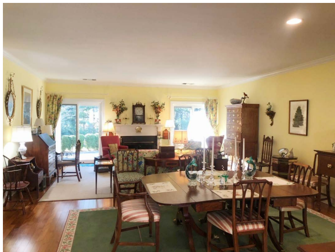
Living / Dining combo