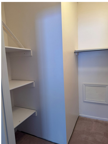
Second Bedroom Closet