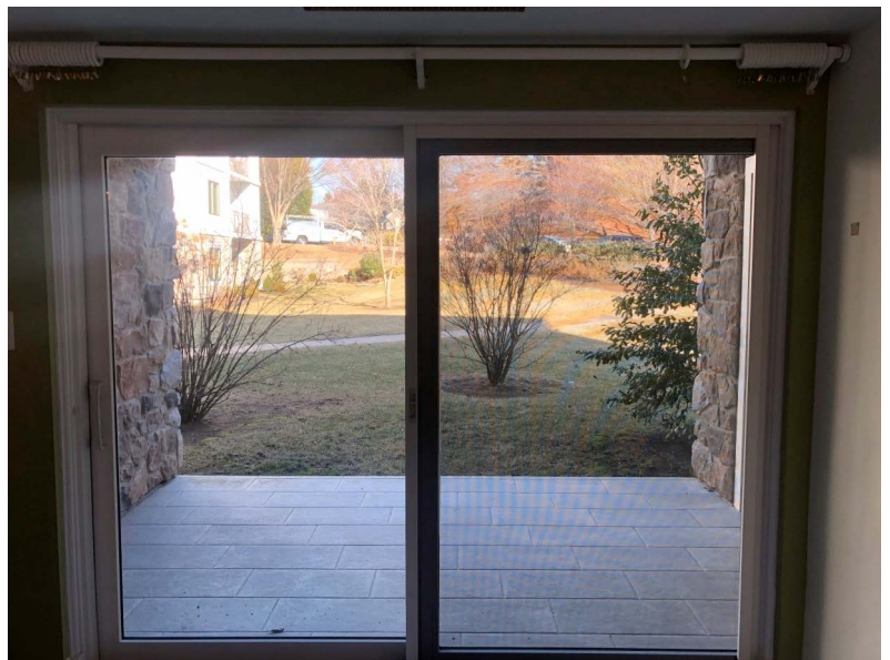
Courtyard view from patio

$326,800.00 * ONE BEDROOM, ONE BATH CHERRY MODIFIED APARTMENT 1,075 SF