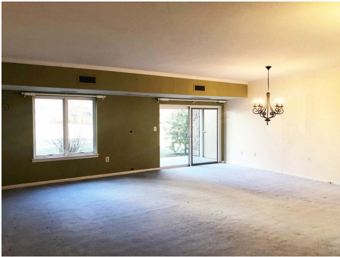
Living Room / Dining Room combination