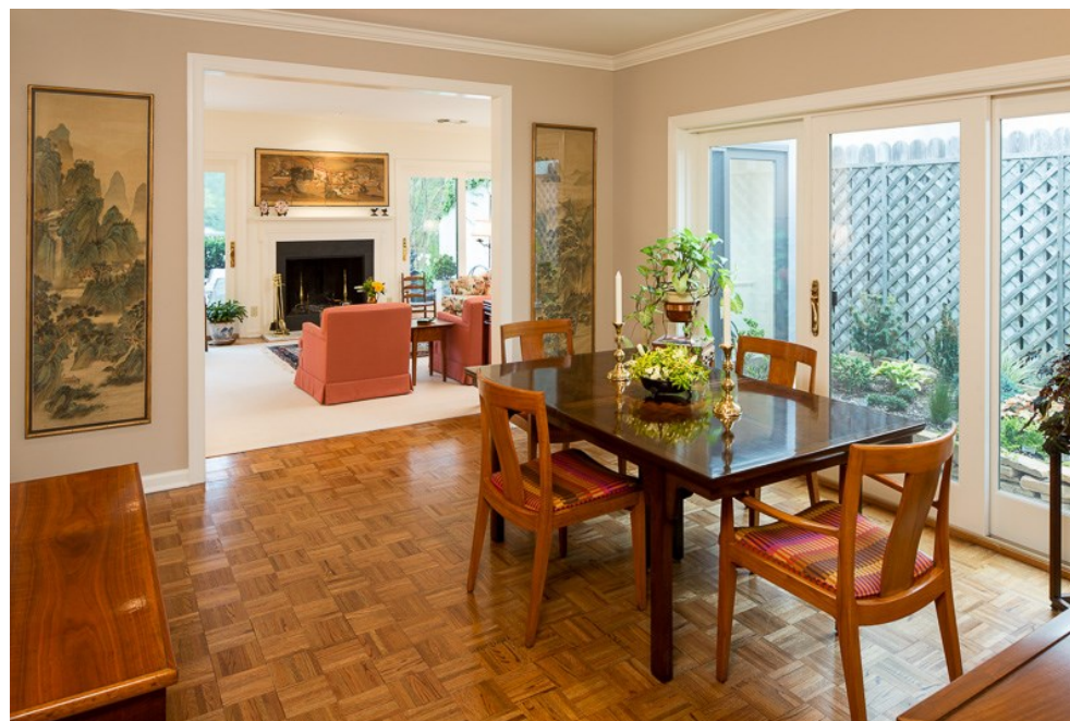
Dining room with atrium