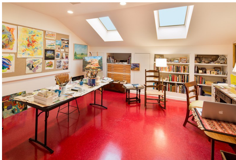
Attic space for studio, office, guest room, etc.