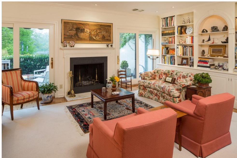
Lovely living room with built-ins and patio access