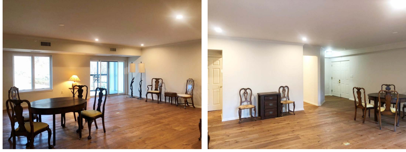
Living Room / Dining Room combination with new flooring throughout