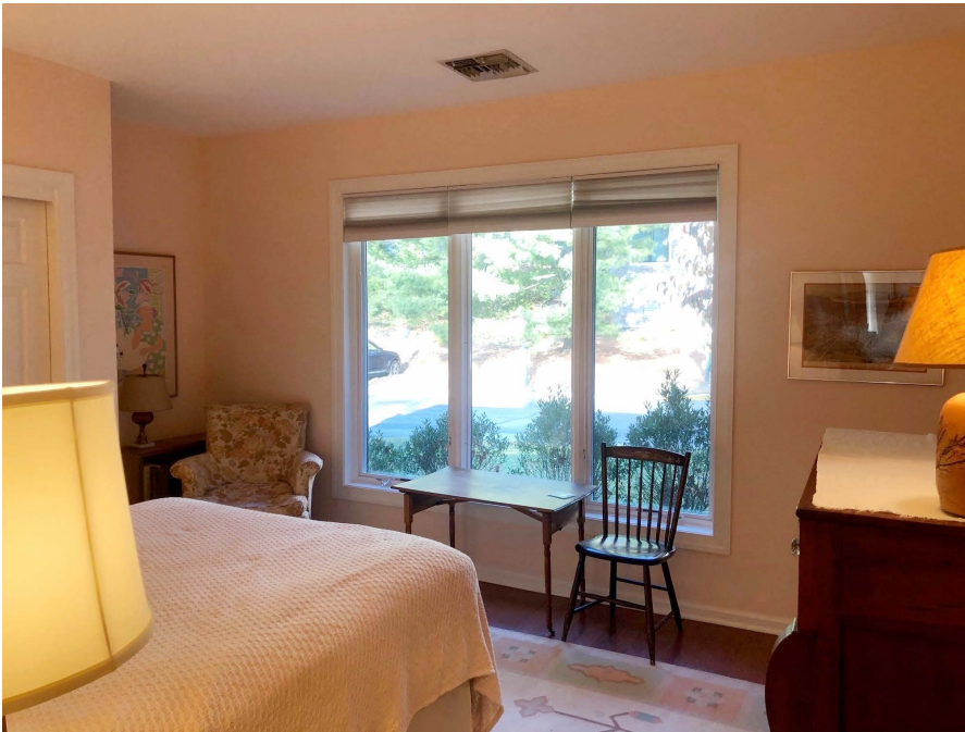
Second bedroom and bath