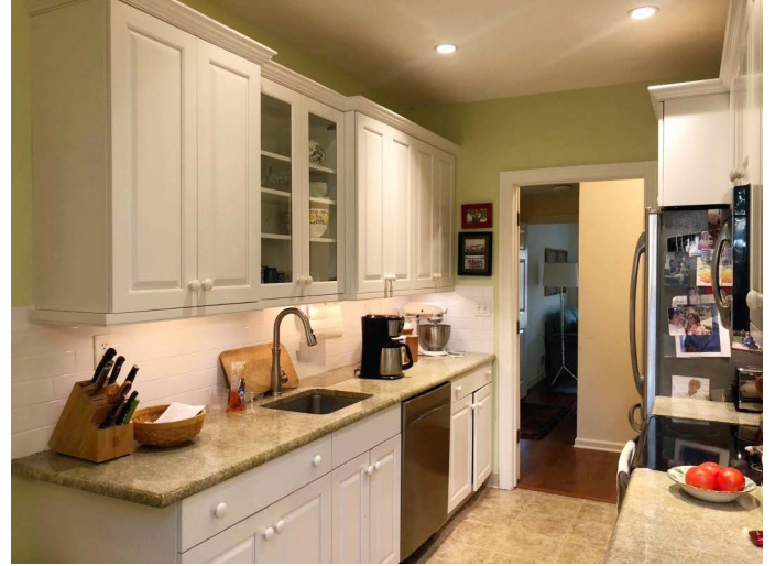
Kitchen with breakfast nook