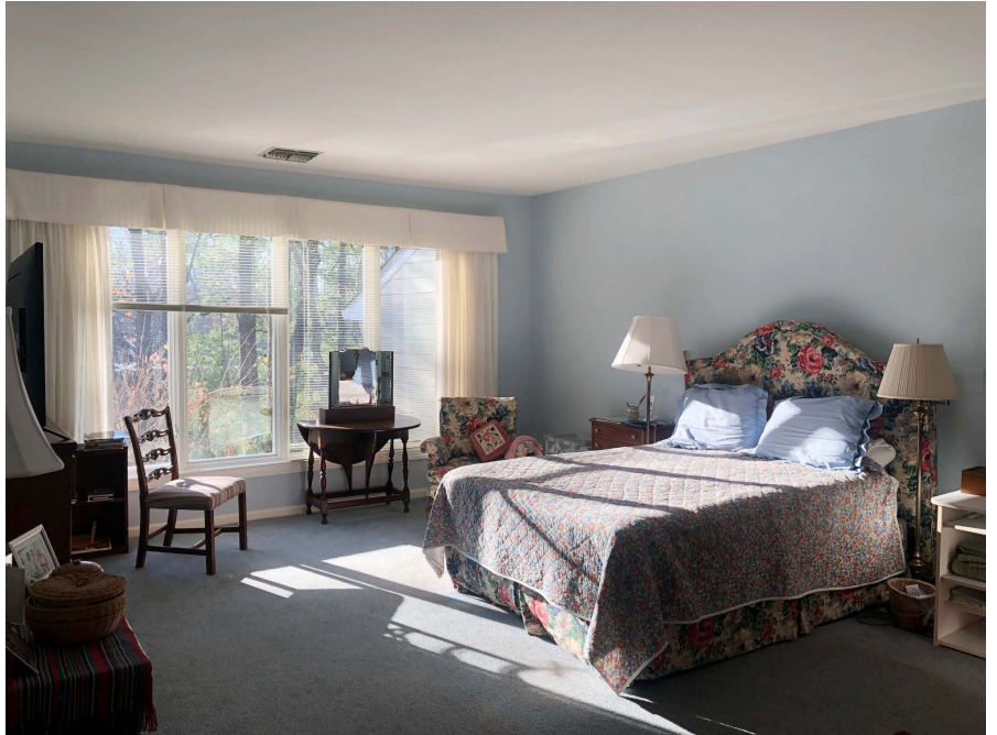
Master bedroom with walk-in closet and master bath with tub and shower