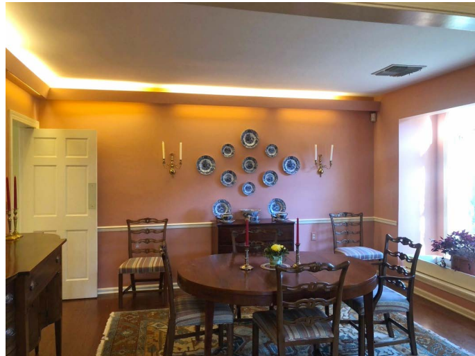
Spacious dining room