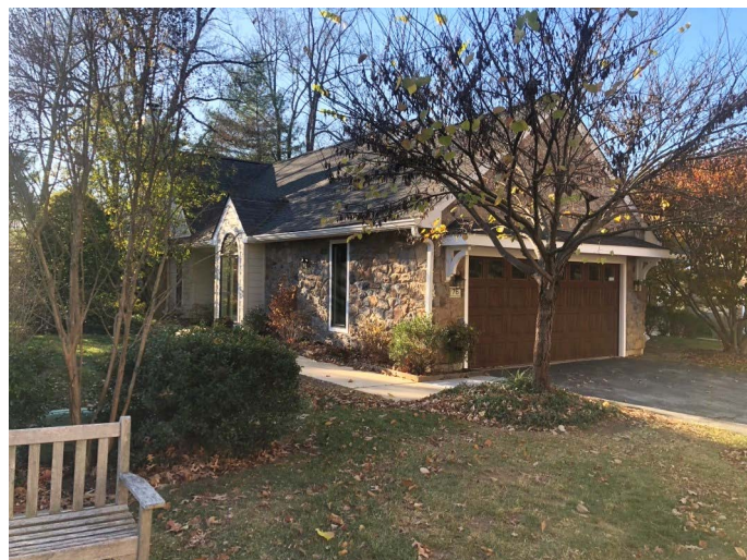
Front of villa, directly across from Austin building garage entrance

$1,450,000.00* TWO BEDROOM, THREE BATH WITH DEN CHESTNUT VILLA, 1,970 SF