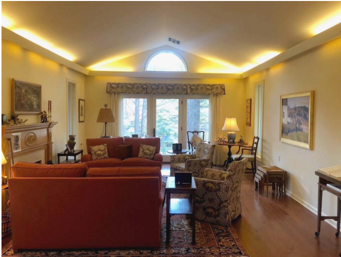
Beautiful living room with patio