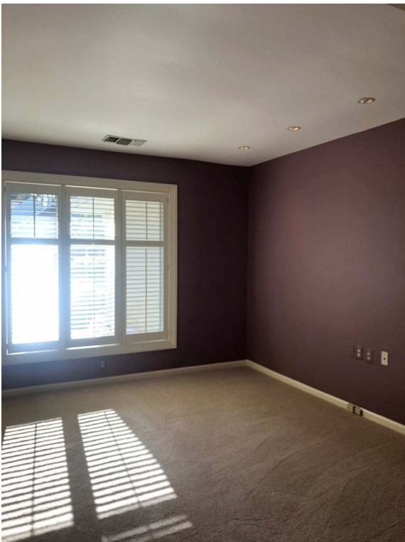
Den with Built-ins

$1,101,067.00 * TWO BEDROOM, TWO BATH APPLE VILLA