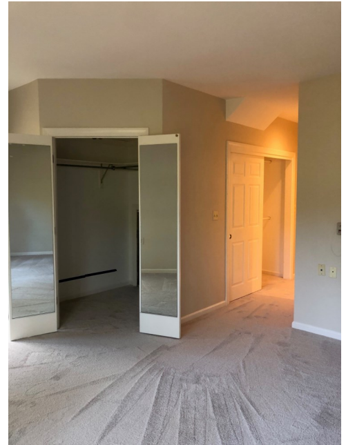
Spacious Master Bedroom with Walk-in Closet, Access to Patio, as well as Bathroom with Shower and Ample Storage