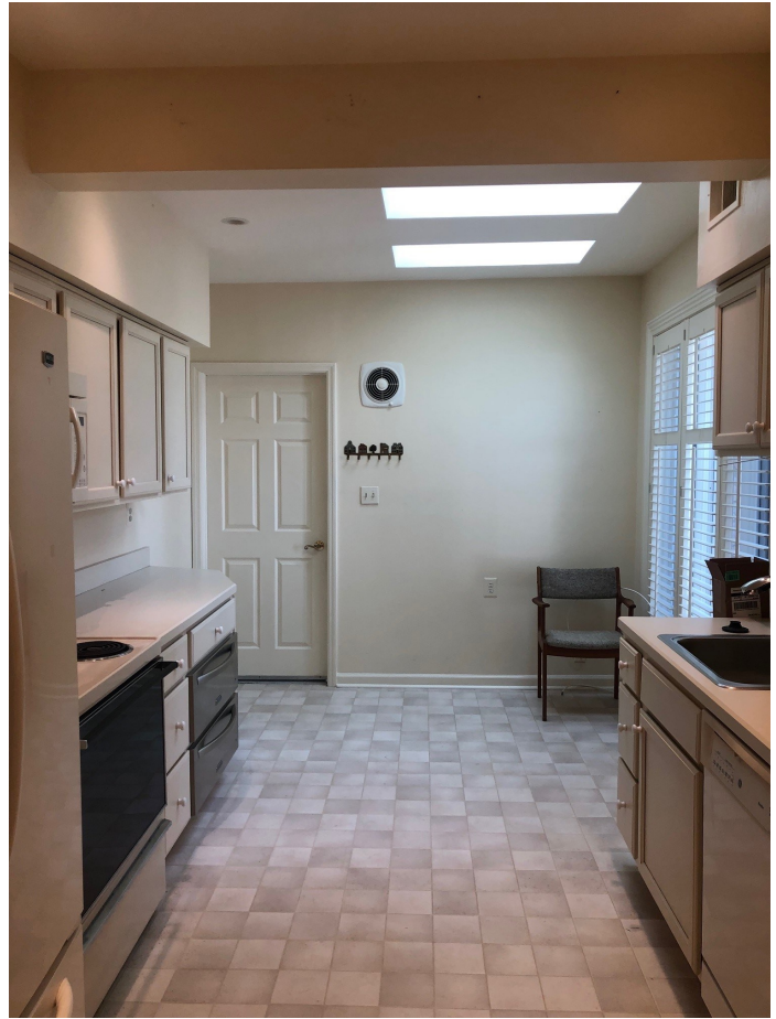
Spacious Living/Dining Room with Wood Burning Fireplace Eat-in Kitchen with Skylights