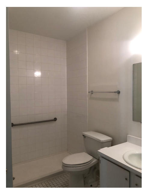
2nd bedroom / den / office with adjacent bath