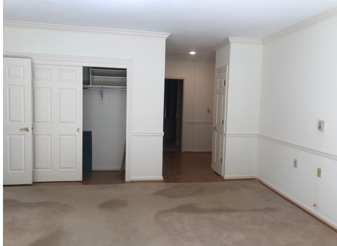
Master bedroom and bath with walk-in closet and patio access