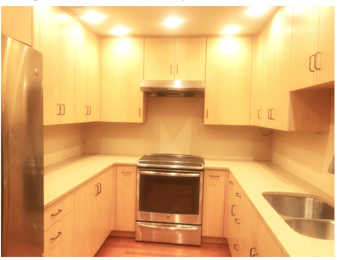
Fully renovated and enlarged kitchen