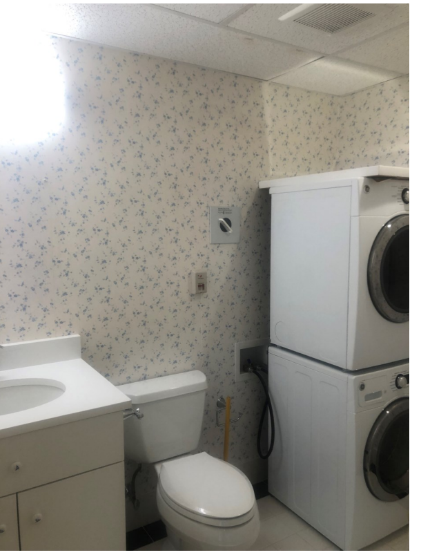
Powder room with laundry