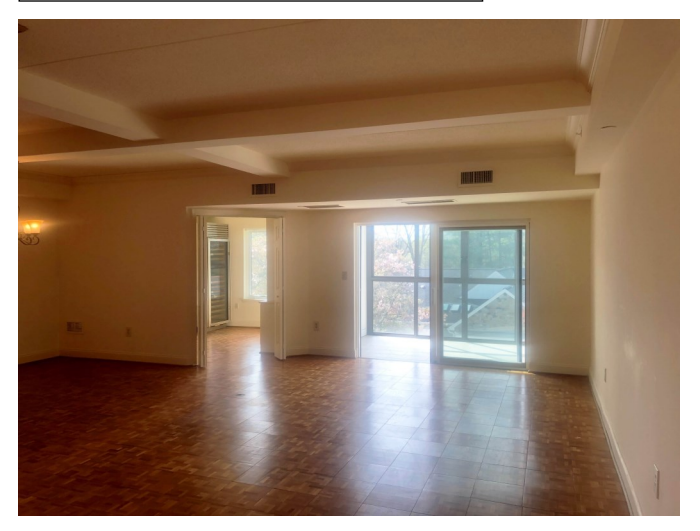
Living Room with southern exposure