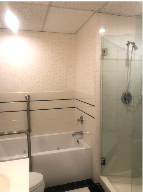
Master bath with jacuzzi tub