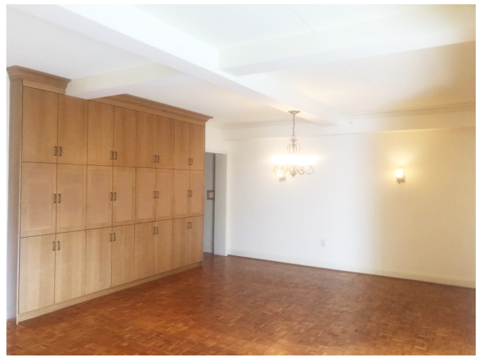
Dining area with custom cabinetry