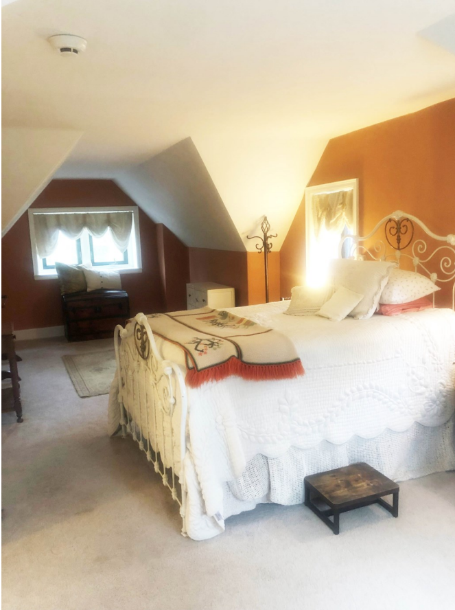
Charming master bedroom