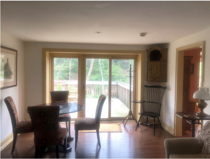
Spacious dining room / sitting area with deck and a view of the woods and creek