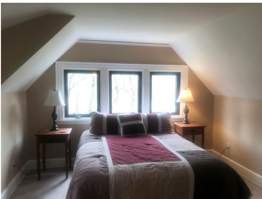
Cozy second bedroom