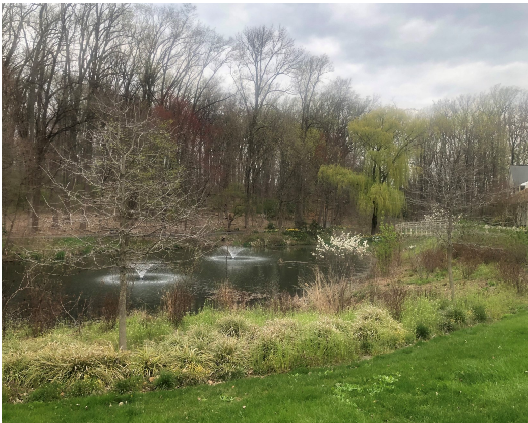
Nearby pond and walking trails