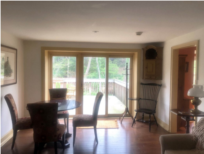
Spacious dining room / sitting area with deck and a view of the woods and creek