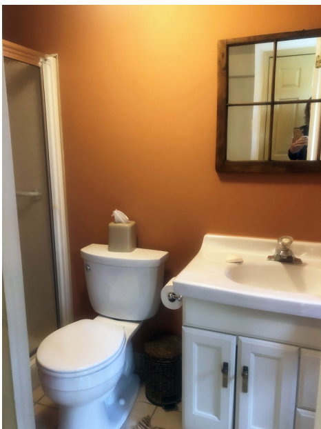
First floor bathroom with stall shower

$950,303.00* THREE BEDROOM, TWO BATH GATEHOUSE