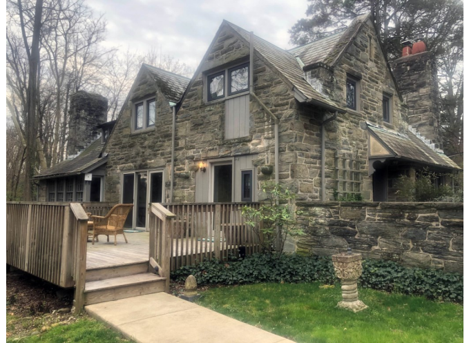
Exterior back with large deck