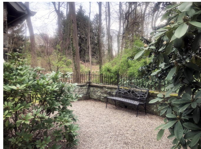
Lovely outdoor sitting area