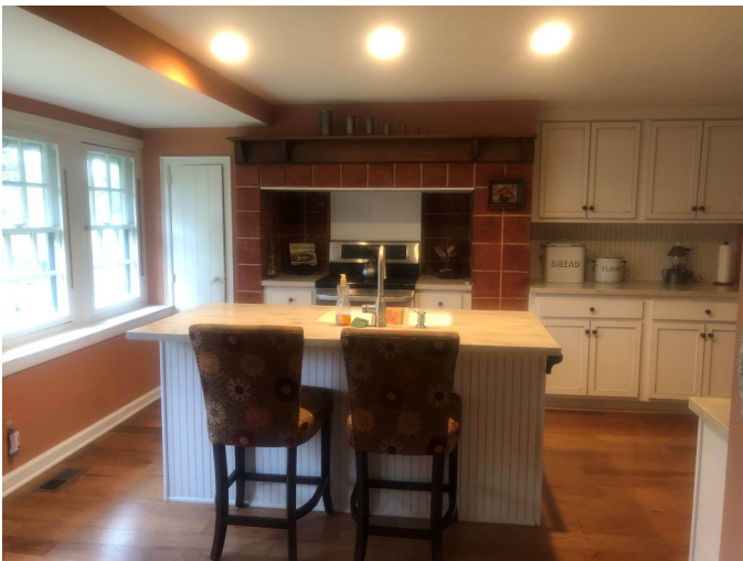
Spacious eat-in kitchen