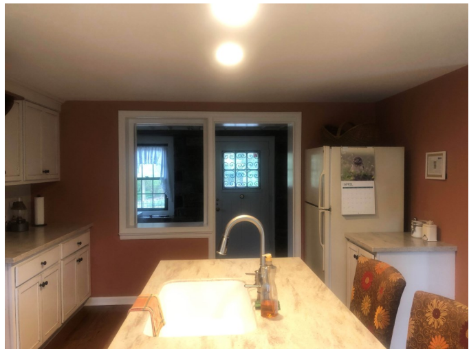
View into laundry room