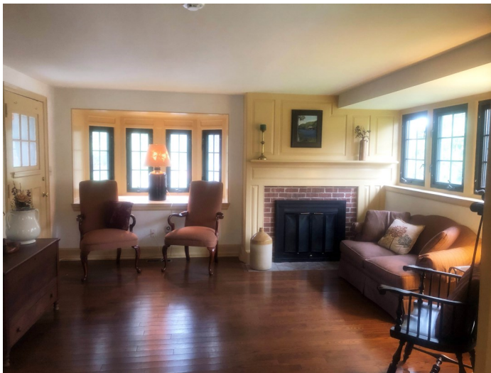
Cozy living room with fireplace