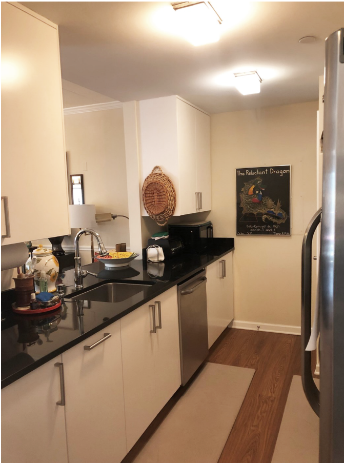
Galley Kitchen with window to dining area