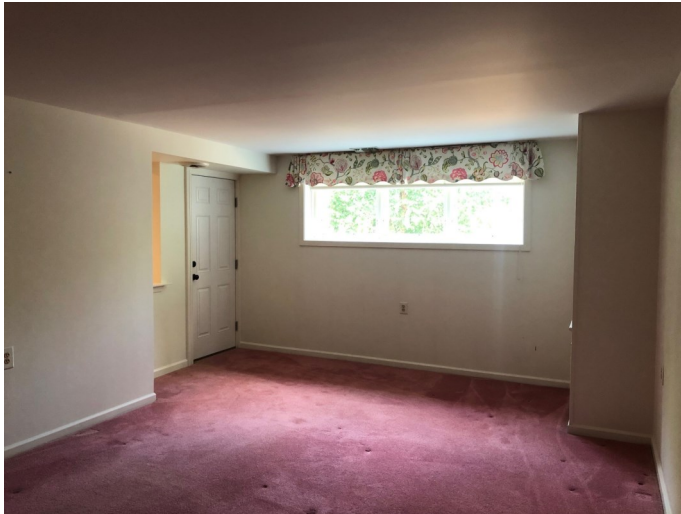
Lower level bedroom with patio access