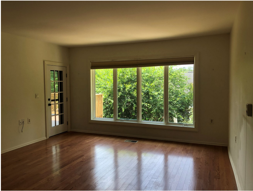
Master Bedroom with deck access and dressing area