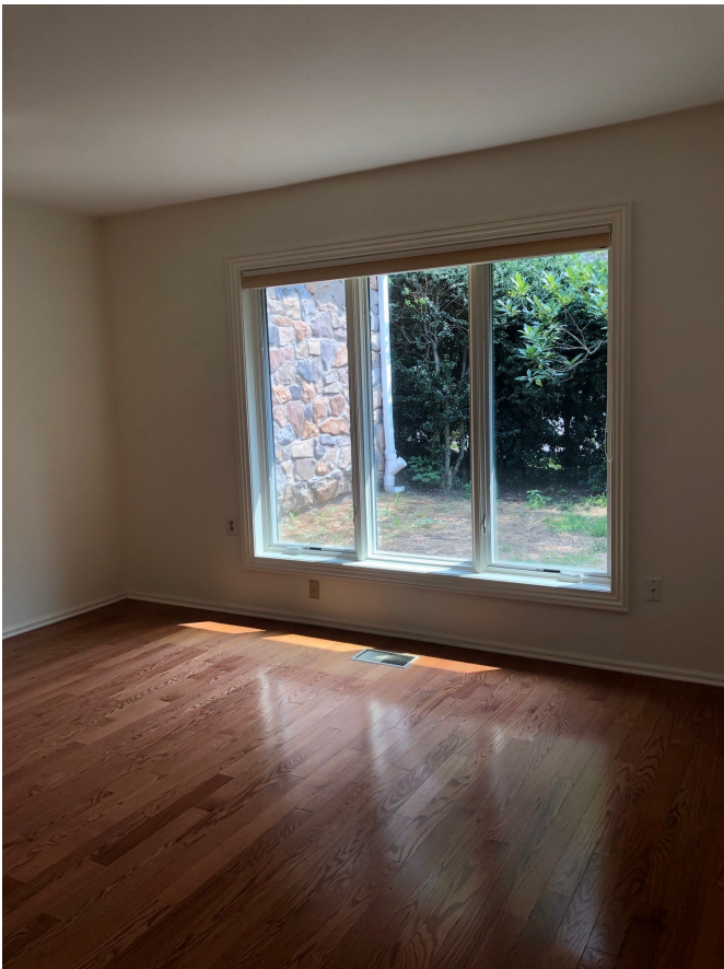
Second Bedroom and guest bath