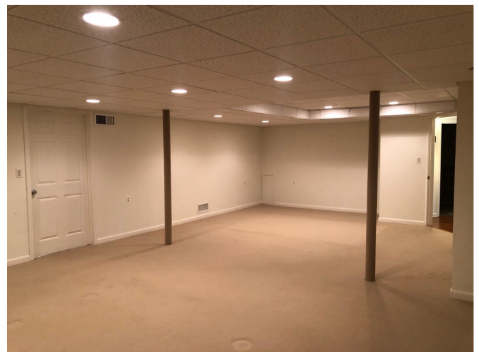
Bonus room / play room