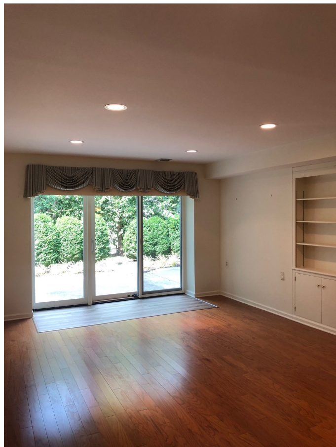
Lower level office / den