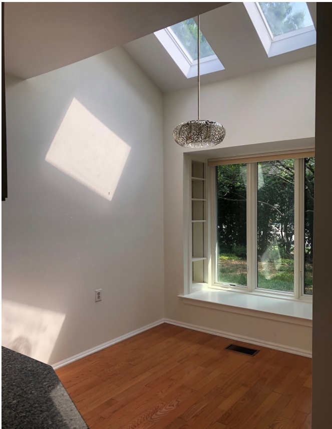
Bright Breakfast Nook