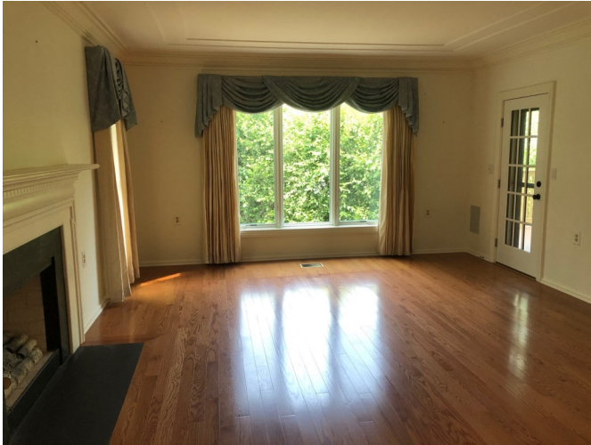
Spacious Living Room with wood burning fireplace