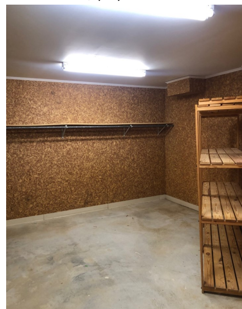
Large walk-in cedar closet