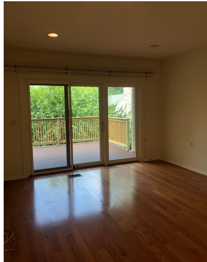
Den with deck access

Thank you for your interest in Beaumont. This two level Chestnut Villa is located at the corner of Middle Road and Pasture Lane close to all the amenities Beaumont has to offer. The monthly fee for this villa is $7,549 (single occupancy) and $9,700 (double occupancy). There is also a $350 per month capital assessment fee.