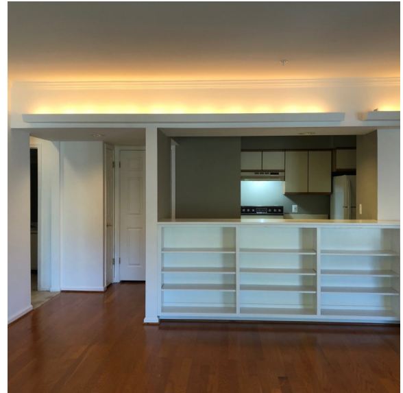
Bright Spacious Living /Dining Room Combination with built-ins