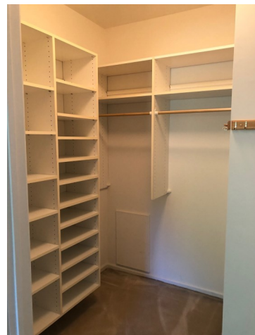
Bedroom with Walk-in Closet

Thank you for your interest in Beaumont. This Cherry apartment is located on the third floor of the Baldwin Building and has an eastern exposure. The monthly fee for this apartment is $5,360 (single occupancy) and $7,409 (double occupancy). There is also a $350 per month capital assessment fee.