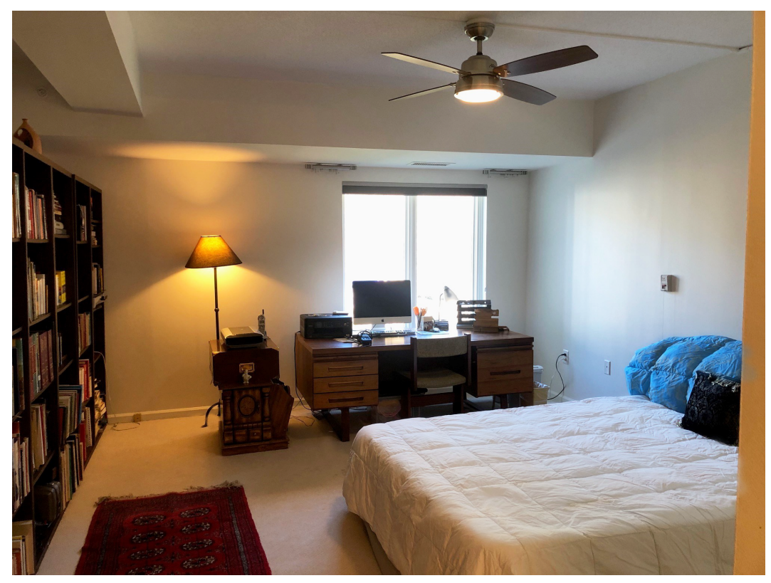
Large Bedroom with walk-in closet and gorgeous bathroom