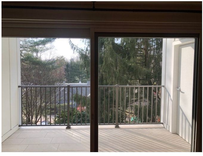
Gorgeous Balcony with western view