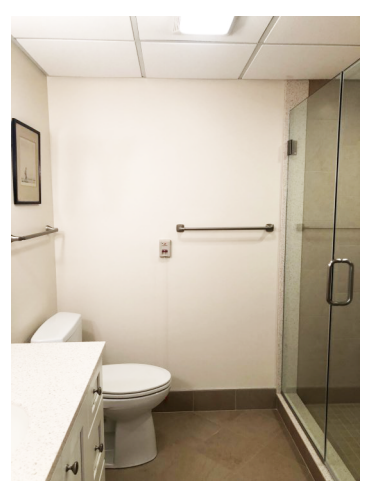
Lovely private Guest Suite with renovated bath