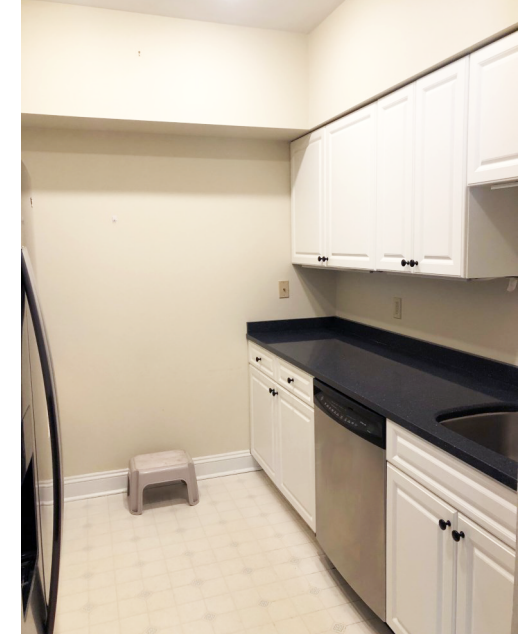
Renovated Galley Kitchen