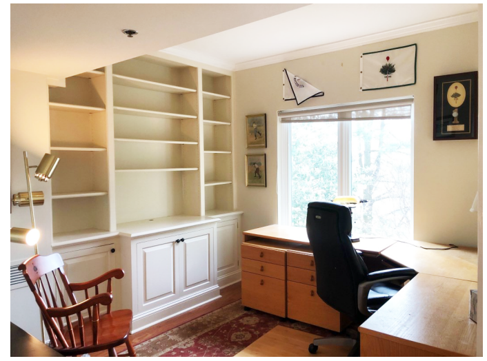
The Library offers a great space for an office or a den.