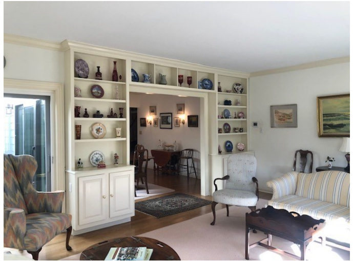
Spacious Living Room with wood-burning fireplace, built-ins, sliders to patio, and adjacent Atrium