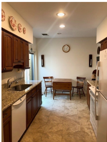
Kitchen with adjacent Atrium