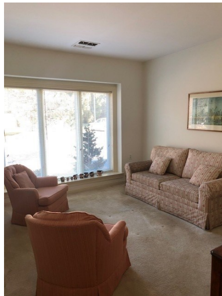
2nd bedroom currently used as den with adjacent full bathroom