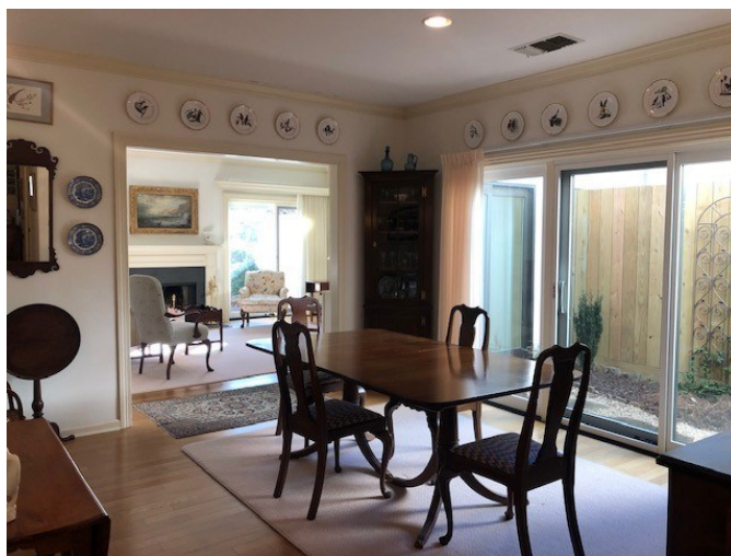
Dining Room with access to Atrium