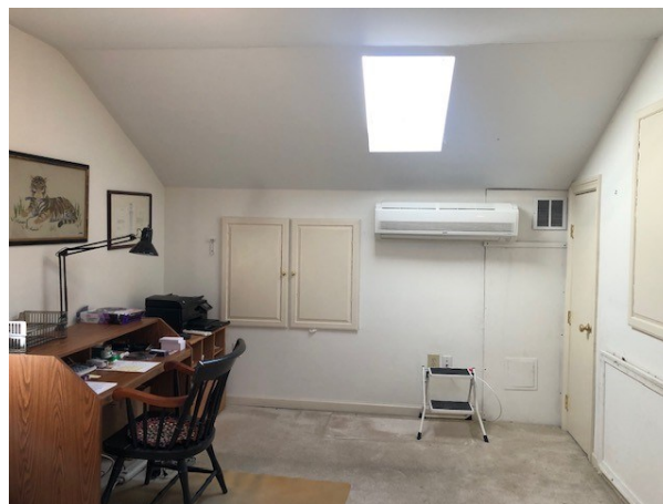
Bonus Attic room with skylight for office, studio, guest room, or simply storage