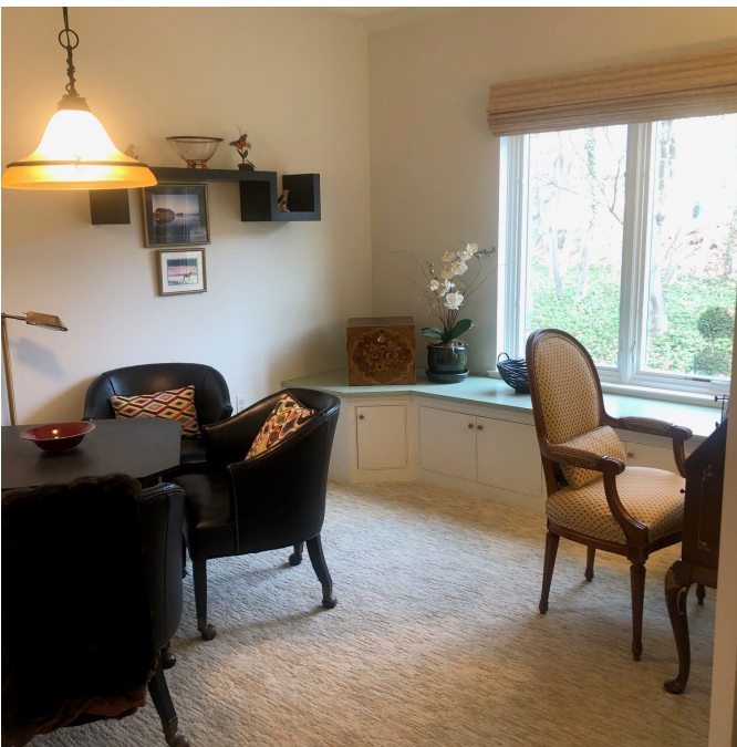
Den with Window Seat / Storage