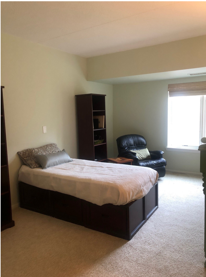
Second Bedroom with Hall Bath