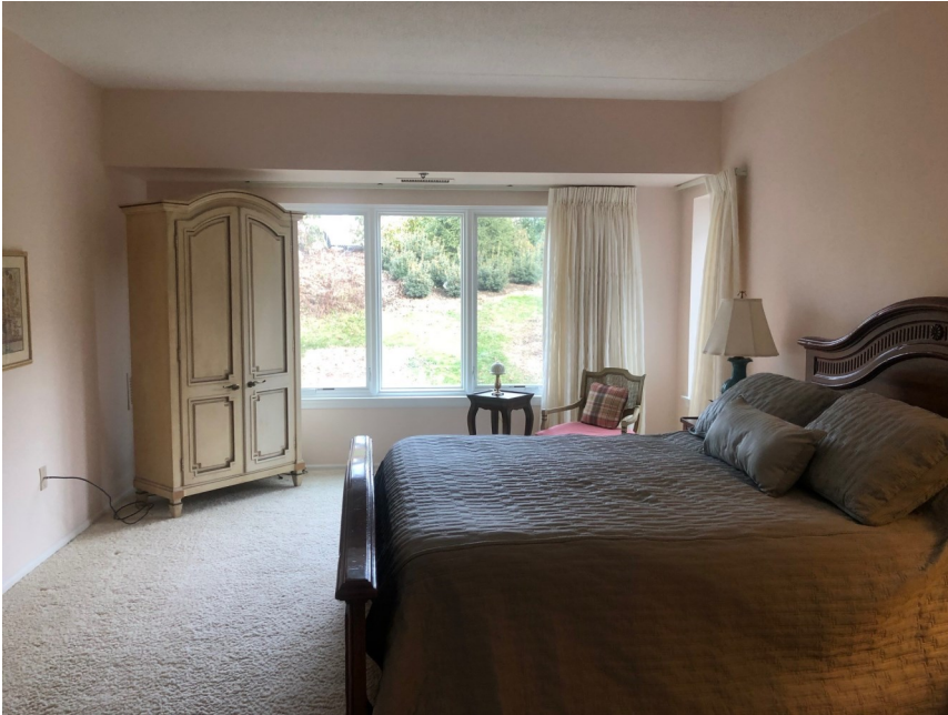
Large Master Suite with Walk-in Closet