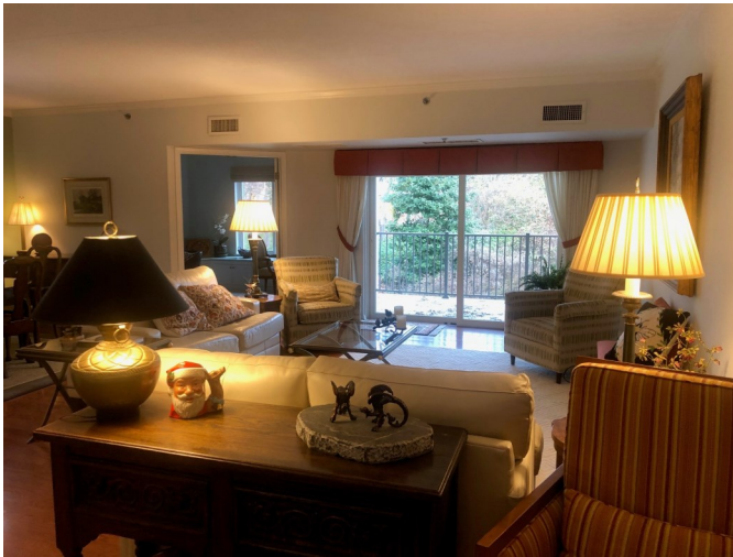
Spacious Living / Dining Room