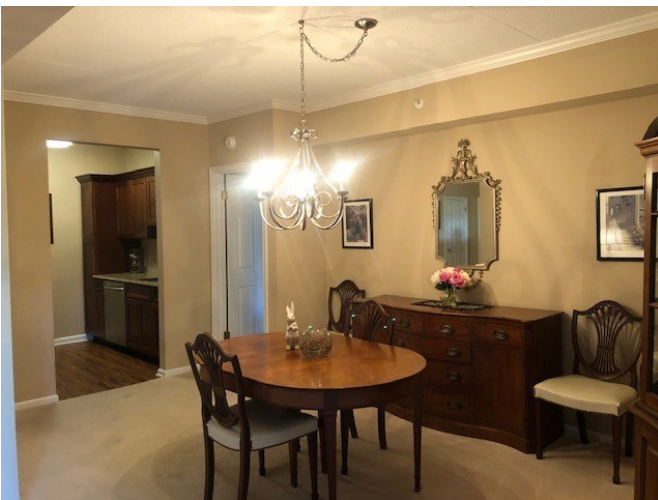
Dining Area looking into beautifully renovated kitchen

Thank you for your interest in Beaumont. This beautiful Pine apartment is located on the first floor of the Baldwin Building. The monthly fee for this apartment is $6,627 (single occupancy) and $8,778 (double occupancy). There is also a $350 per month capital assessment fee.