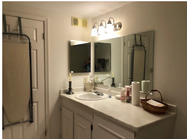
Guest Suite (currently used as an office) and full bath