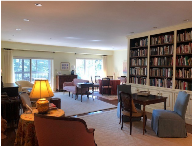
Bright Spacious Living Room with built-ins and beautiful balcony