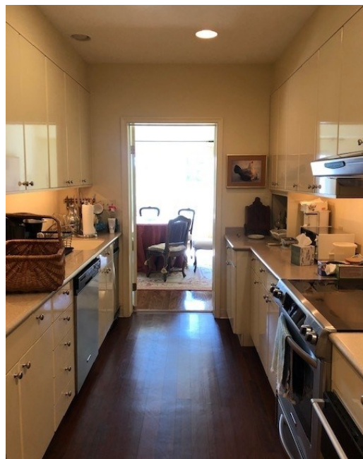
Galley kitchen leading to dining area

Thank you for your interest in Beaumont. This corner Birch apartment is located on the third floor of the Baldwin Building and has eastern and southern exposures. The monthly fee for this apartment is $7,262 (single occupancy) and $9,311 (double occupancy). There is also a $350 per month capital assessment fee.