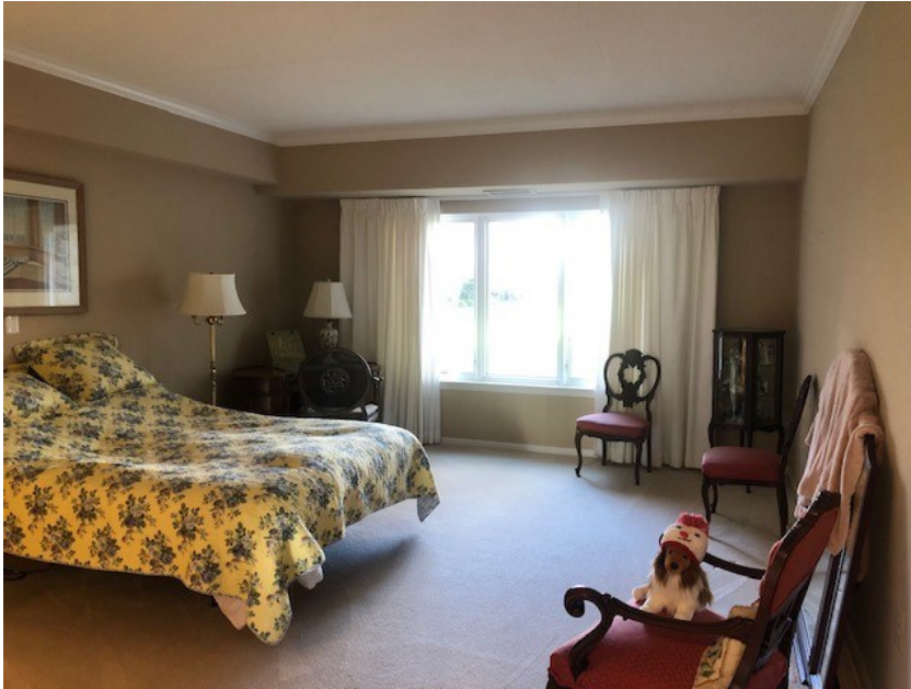
Master Bedroom and bath with walk-in closet