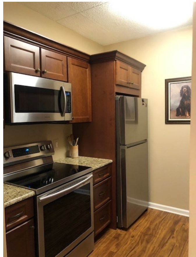
Newly Renovated Galley Kitchen

* Plus a one time Special Assessment of 67,000 for our campus-wide enhancement project. Call for details!