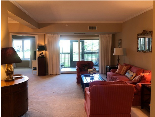
Spacious Living Room with enclosed patio