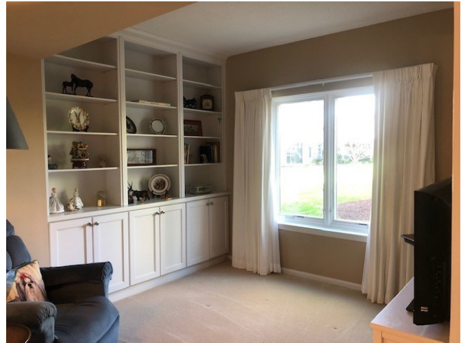
Den / Office with built-ins