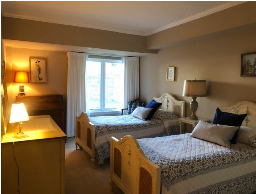
Lovely Guest Bedroom and Bathroom