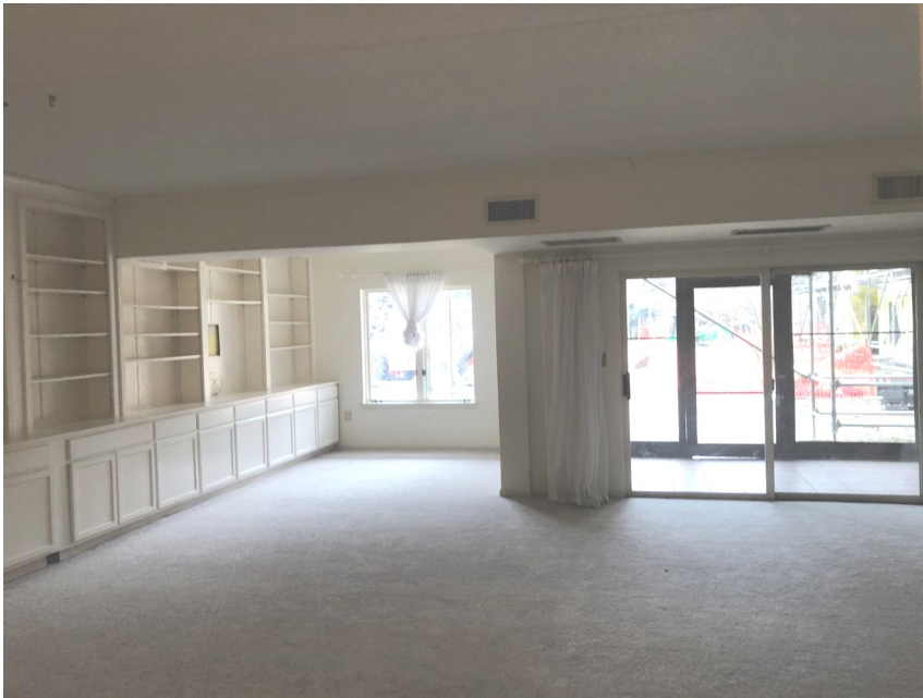
Spacious Living Room with a Wall of Built-ins