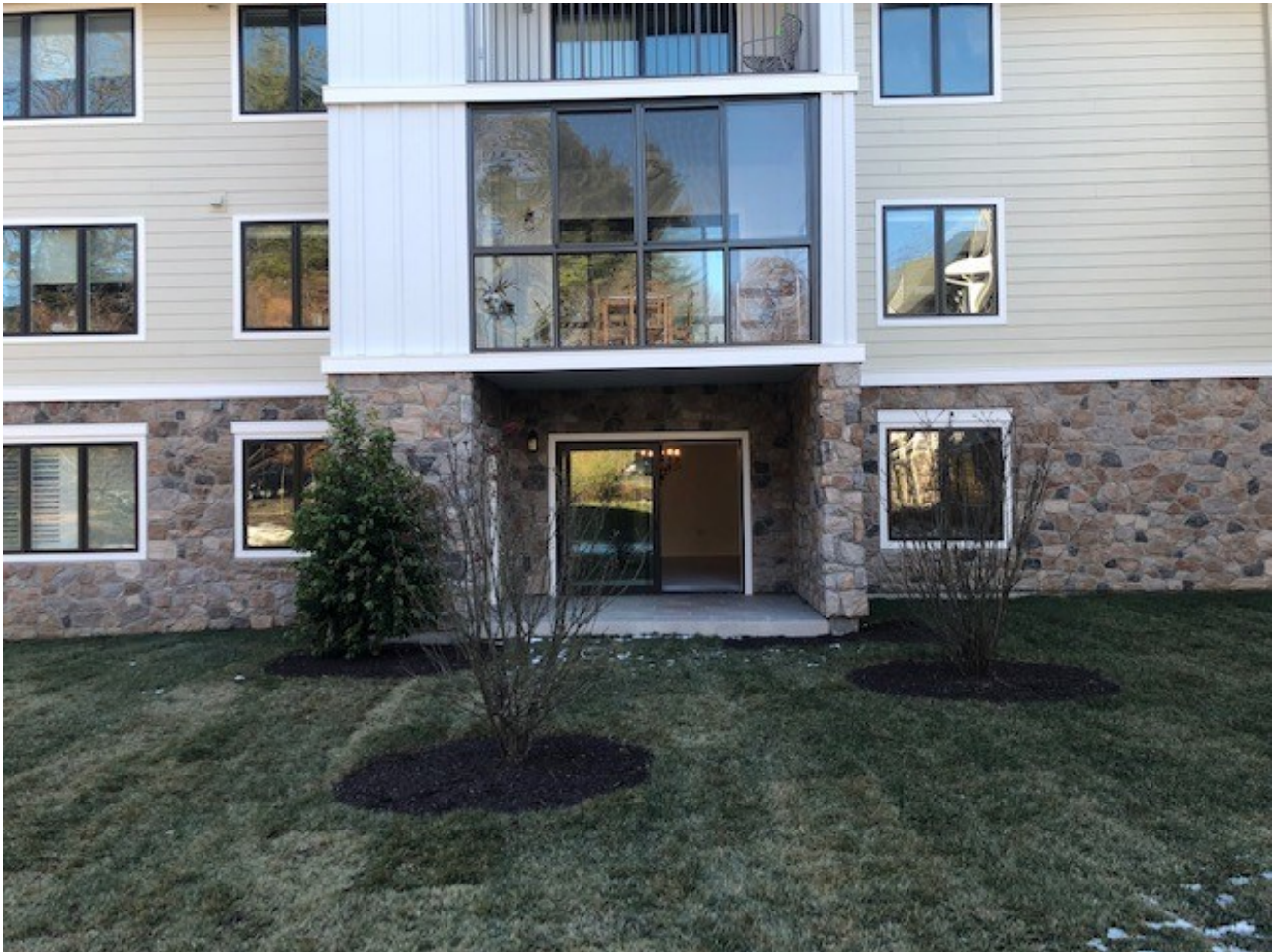
New Façade, Windows, Doors and Patio!