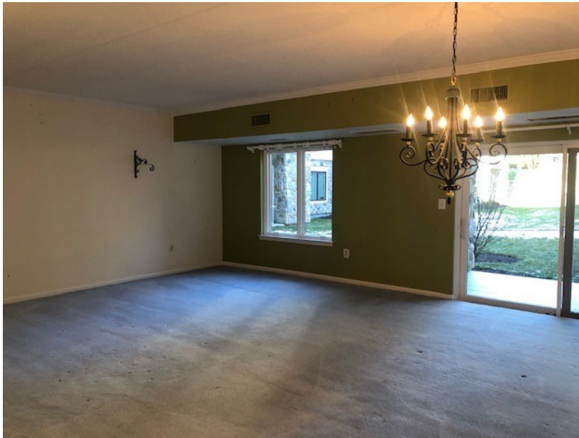
Beautiful Living Room with Open Floor Plan