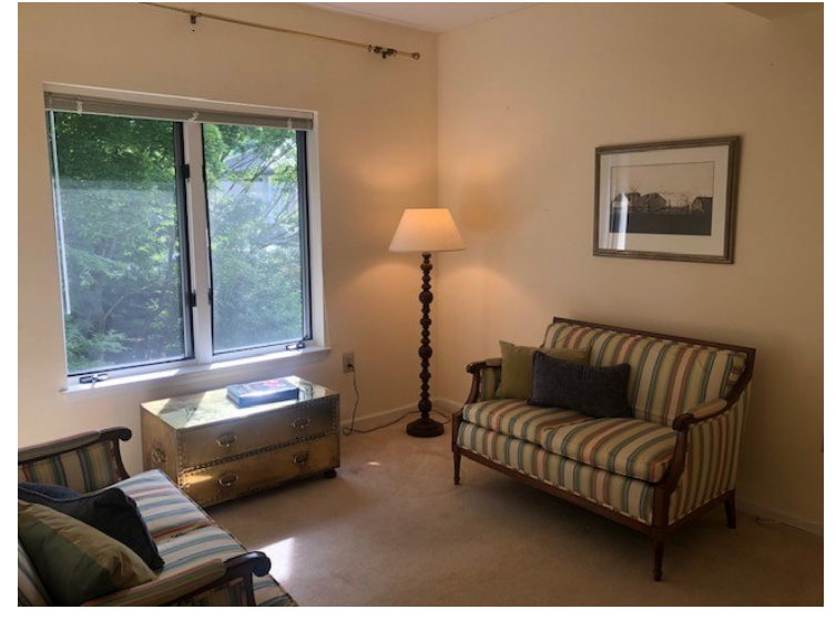
Relax in Your Cozy Den