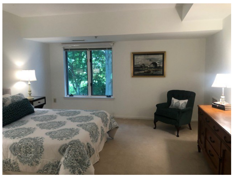
Master Bedroom with Walk-in Closet

There's no better time than the present to join our active, caring community where you're safe, protected and surrounded by friends. During these uncertain times Beaumont offers a nurturing, supportive environment. Consider joining us as we have welcomed many new residents in the past year!