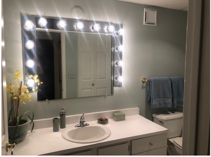
Bathroom with Large Storage Closet