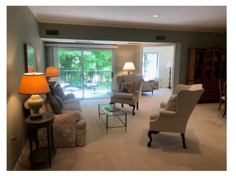
Beautiful Open Concept Living / Dining Room