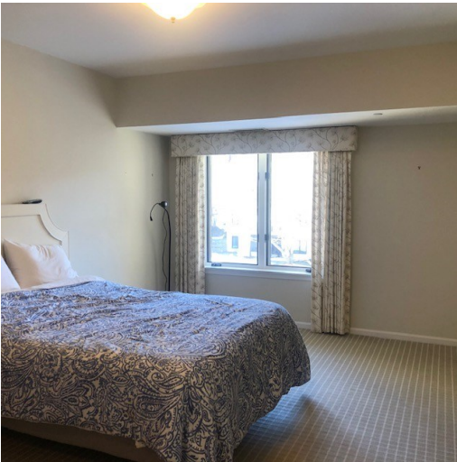
Master Bedroom with walk-in closet