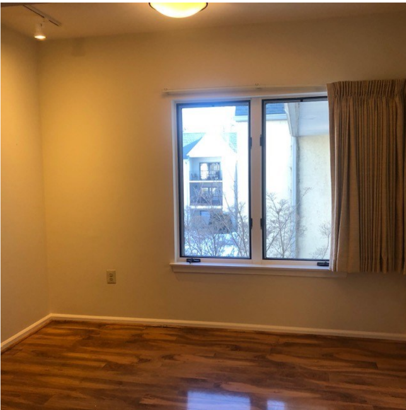
Second Bedroom with huge walk-in closet