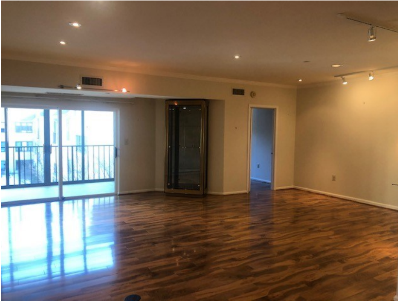
Living Room & Den with a beautiful bright view

$560,000.00* TWO BEDROOM, TWO BATH MODIFIED LOCUST APARTMENT 1,356 SF