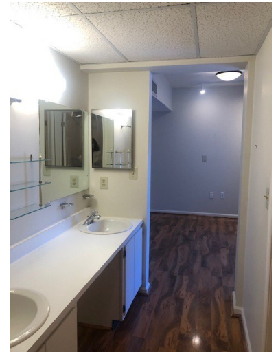
Second Bathroom with tons of storage