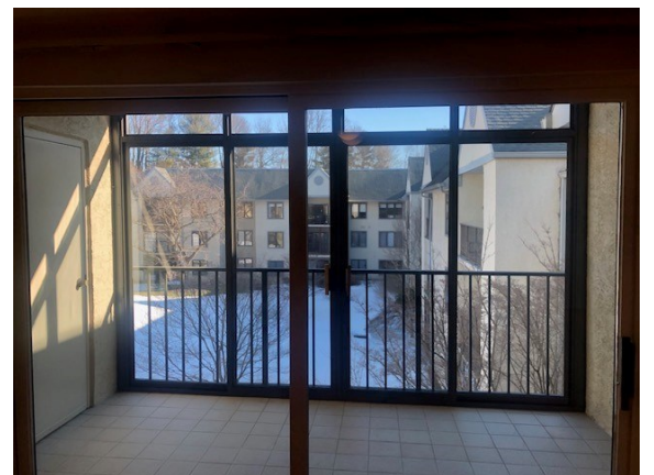
Lovely Enclosed Balcony with Courtyard View

* Plus a one time Special Assessment of $71,000.00 for our upcoming campus-wide enhancement of our campus. Call for details!