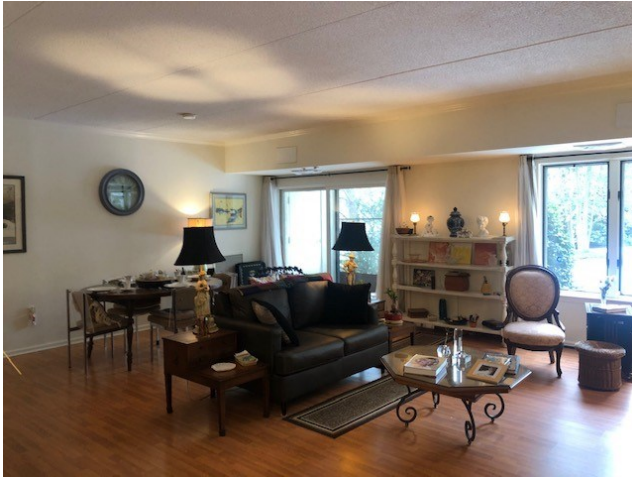
Beautiful Living Room with Open Floor Plan