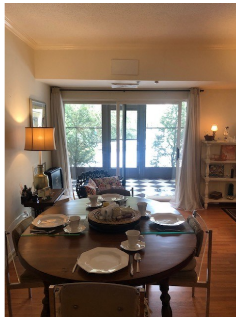
Dining Area Looking upon Enclosed Balcony for Extra Living Space