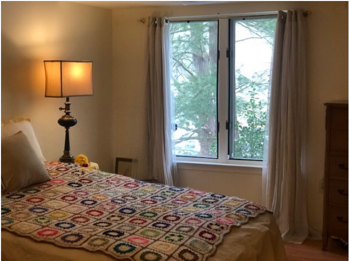
Large Bedroom with Walk-in Closet