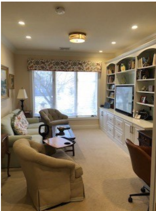
Den / Office