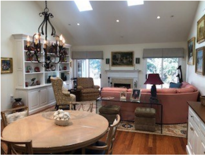
Open Concept Living / Dining Room