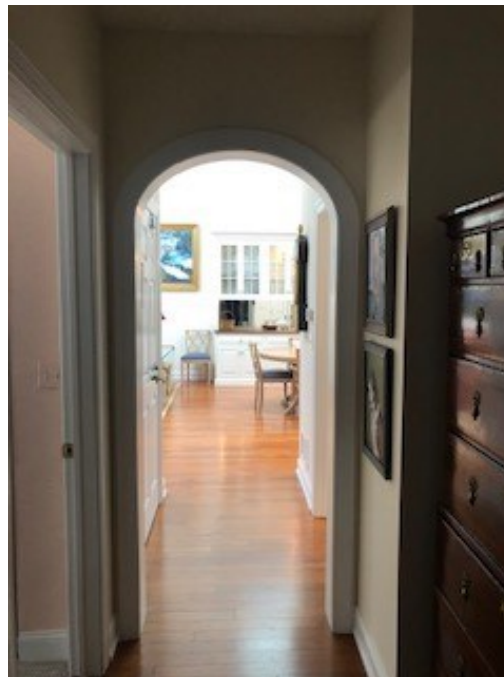
Charming Arched Doorway in Hallway