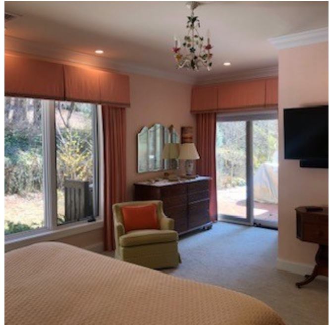
View to Patio and Outdoor Space