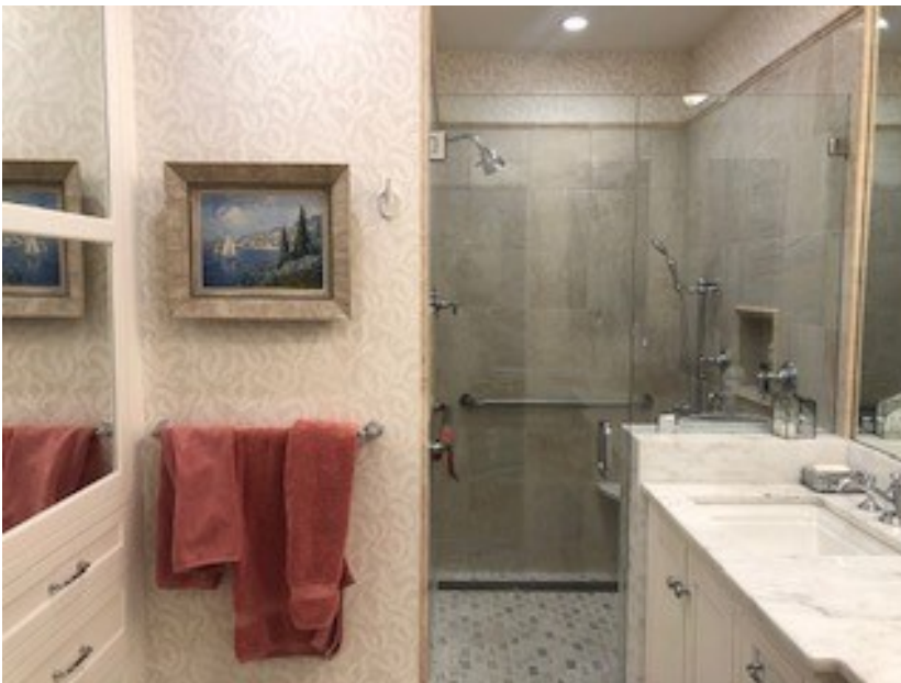
Large Master Bath with Walk-in Shower