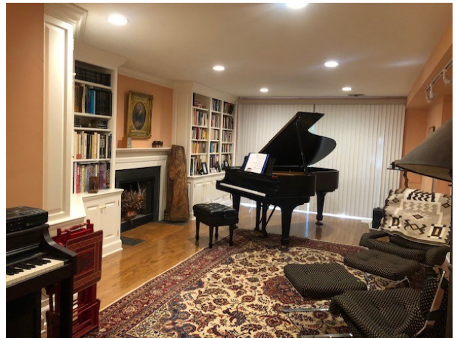
Lower Level Living Area