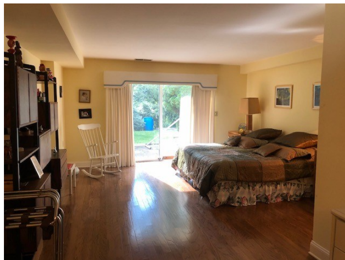
Lower Level Bedroom