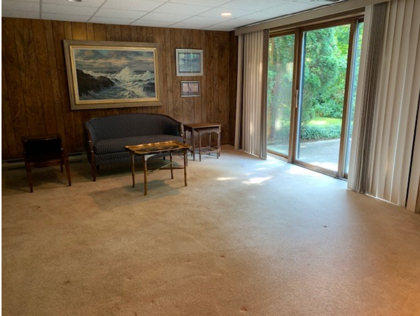
Lower Level Living Room