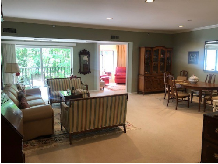
Living / Dining Room